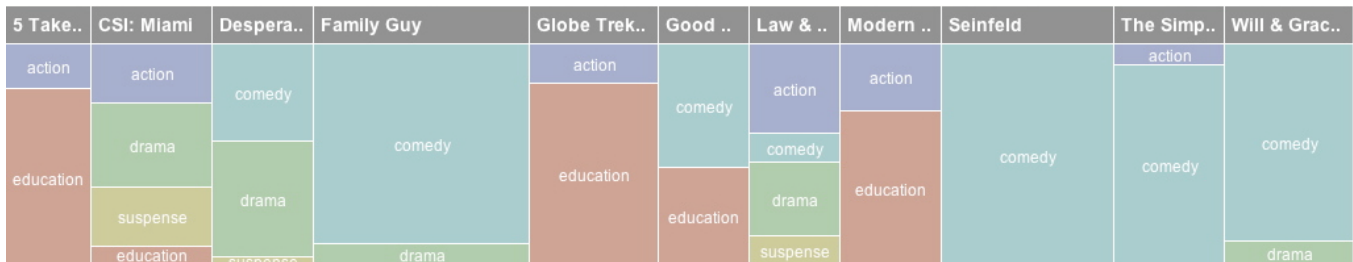
Figure 3. Show ratings visualization.

The ratings visualization also enjoyed a positive response. When users were asked if they felt the mosaic plot was intuitive, about a fifth of the respondents disagreed, with one person strongly disagreeing. This result was somewhat expected - despite efforts to simplify its appearance, the mosaic plot remains quite a sophisticated visualization technique, and one that most users will have never encountered. Regardless, just under half agreed or