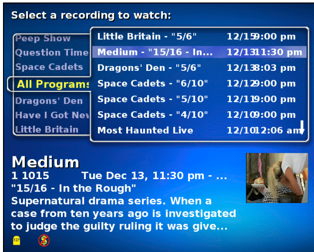
Figure 4. The MythTV EPG for recorded programming. This interface was included in the study so that participants could compare iEPG with a conventional list-based EPG.

strongly agreed that it was intuitive ( m=3.43 , sd=1.11 ). From comments made during the study, it was clear that most participants saw its value, but that it would take time for them to fully understand and utilize what it was showing. This anecdotal evidence is supported by results from a subsequent question, asking users if they believed the ratings visualization was useful, in which people who disagreed or strongly disagreed dropped to about one-eighth of the participants, creating a more positive distribution ( m=3.47 , sd=0.95 ).